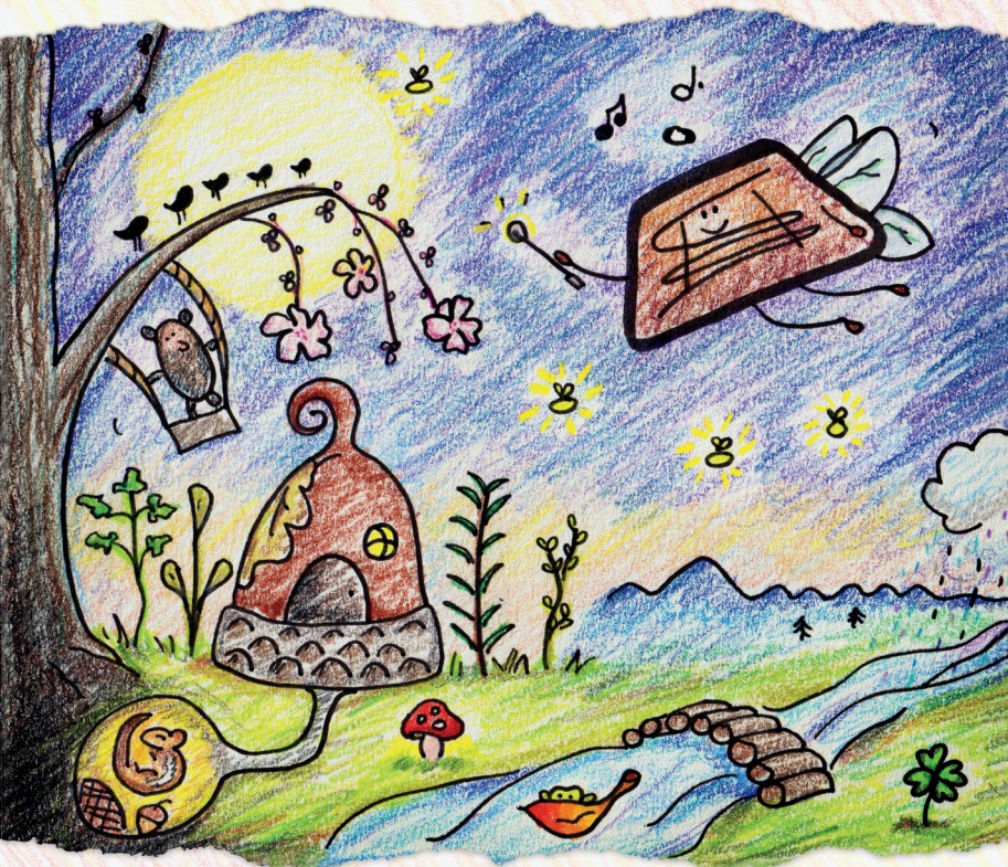
Hammy the Dulcimer in "Fairy Flight"